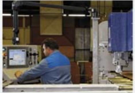
Hanging control panel