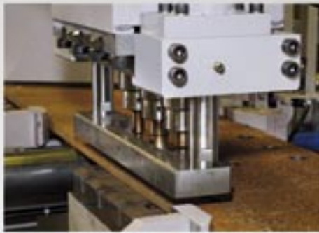
Punching unit with 3 tools selector