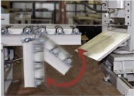
Tilting element of exit table