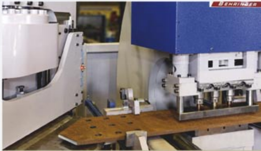
MARKING, PUNCHING, SHEARING LINE FOR FLAT BARS