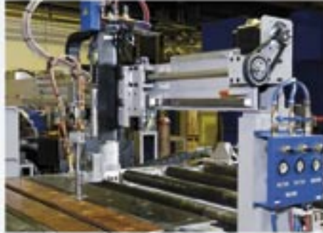
Separate oxy cutting frame