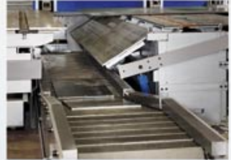
Conveyor evacuating finished parts