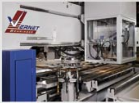
11 kW drilling unit with rotating tool changer